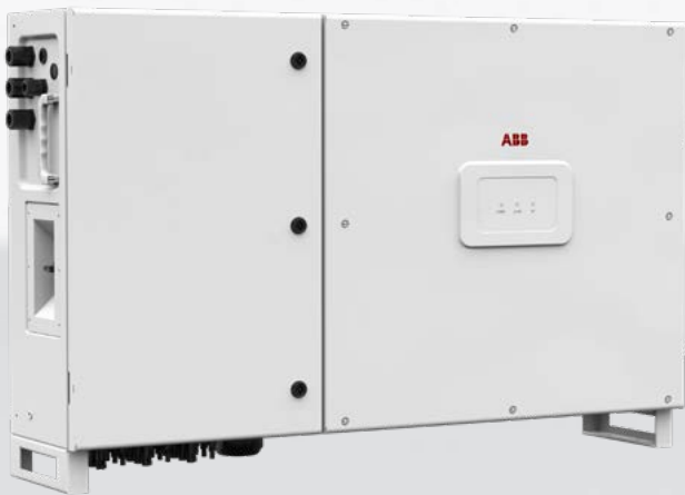
— PVS-50/60-TL string inverter

This new addition to the PVS string inverter family, with 3 independent MPPT and power ratings of up to 60 kW, has been designed with the objective to maximize the ROI in large systems with all the advantages of a decentralized configuration for both rooftop and ground-mounted installations.