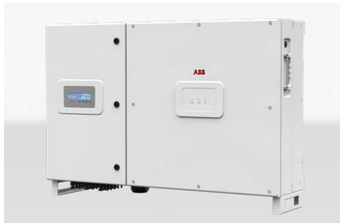
ABB string inverters PVS-50/60-TL